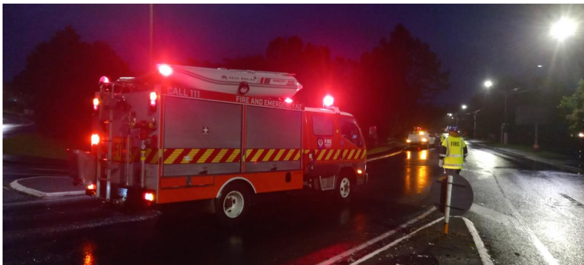
Figure 3: Auckland OSU2 transporting a boat on its roof during the Anniversary weekend floods.

While Auckland was still cleaning up from the earlier event, Cyclone Gabriel hit with its greatest rainfall and strongest winds occurring on the night of Monday 13 February. Although not particularly busy leading up to and on the night of the Cyclone's greatest damage (6 weather related incidents out of 8 callouts on the Sunday- Monday), the Brigade was then again exceptionally busy the following day with 8 more weather incidents out of 10 callouts on the Tuesday.