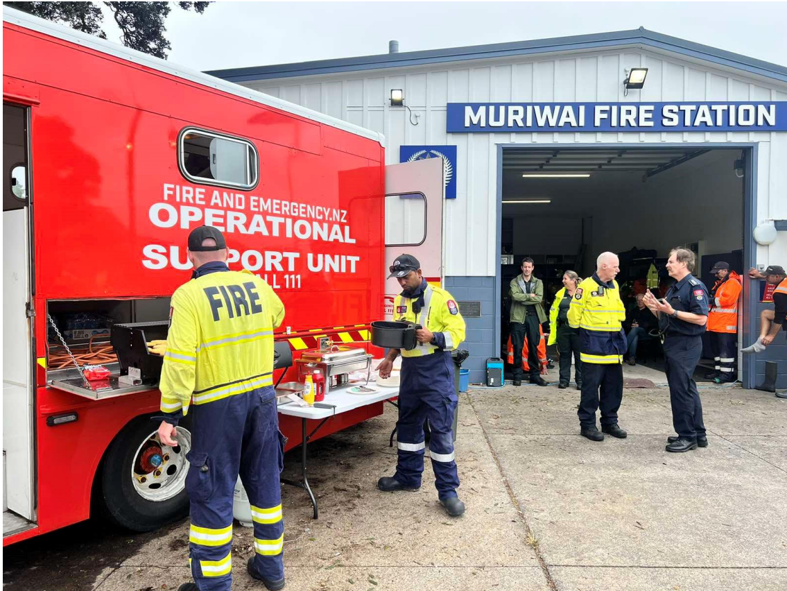
Figure 4: Members assisting at Muriwai Fire Station following the storm of 13 February 2023.