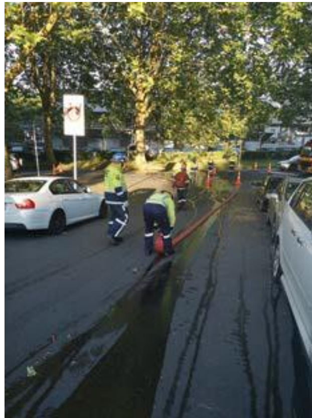
Figure 1: Making up feeders after a building fire