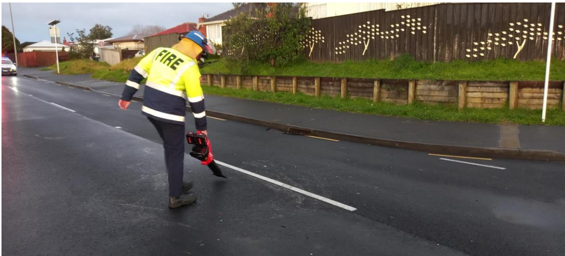
Figure 7: FF Bean utilising a new leaf blower to clear debris from the roadway