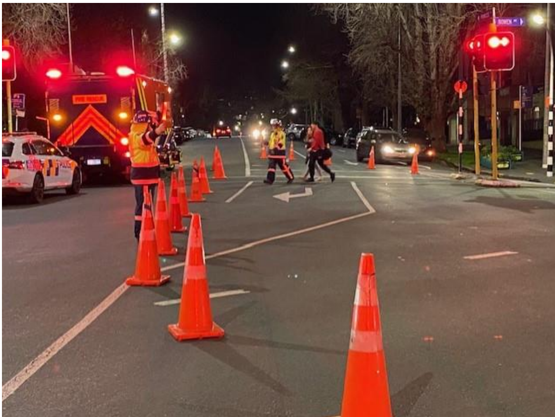
Figure 2: Members assisting with traffic control at 2nd Alarm Pullman Hotel, 22 July 2023